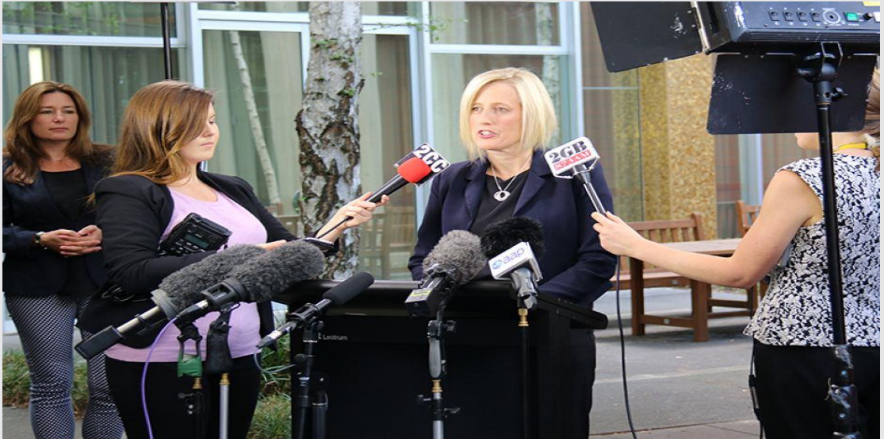
Photo: ACT Chief Minister Katy Gallagher says she will stand down from the position of Chief Minister next Wednesday.